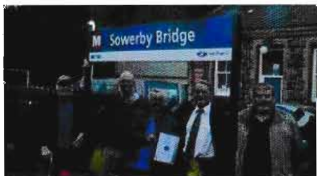
Members with the YIB Certificate

Without doubt, one of our biggest achievements this year has been the Yorkshire in Bloom 'Silver Rose Gilt' award which our members and volunteers within the local community worked together to make possible. Next year, with more involvement from youth and community groups, we aim to achieve an even higher award.